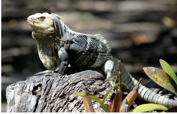
FIGURE 1: Black-chested Spiny-tailed Iguana ( Ctenosaura melanosterna ).

those captured and sampled directly (i.e., immediately). Both studies show baseline stress hormone levels that are significantly higher in the cage-trapped animals than the directly sampled animals, which demonstrates that animals perceive the cage environment as “stressful,” even if they appear visibly calm in the traps [15]. Moreover, Fletcher and Boonstra [14] discovered that stress levels remained high among all cage-trapped animals, regardless of the amount of time spent in traps. This result has considerable implications for all projects involving immune measures, especially when one considers how elevations in stress hormones can lead to alterations in the normal populations of leukocytes in circulation (reviewed in [16]); it then stands to reason that animals that remain in traps before blood sampling could in the end have altered leukocyte profiles that reflect this stress effect. Specifically, elevated stress hormones can lead to increases in circulating neutrophils (in mammals and amphibians) or heterophils (in reptiles and birds), and decreases in circulating lymphocytes, and this has been empirically demonstrated in all vertebrate taxa [16]. Given the widespread use of baited cage traps in wildlife research, and the importance of correct interpretations of leukocyte data for this research, be it ecological or veterinarian, this issue clearly warrants attention.