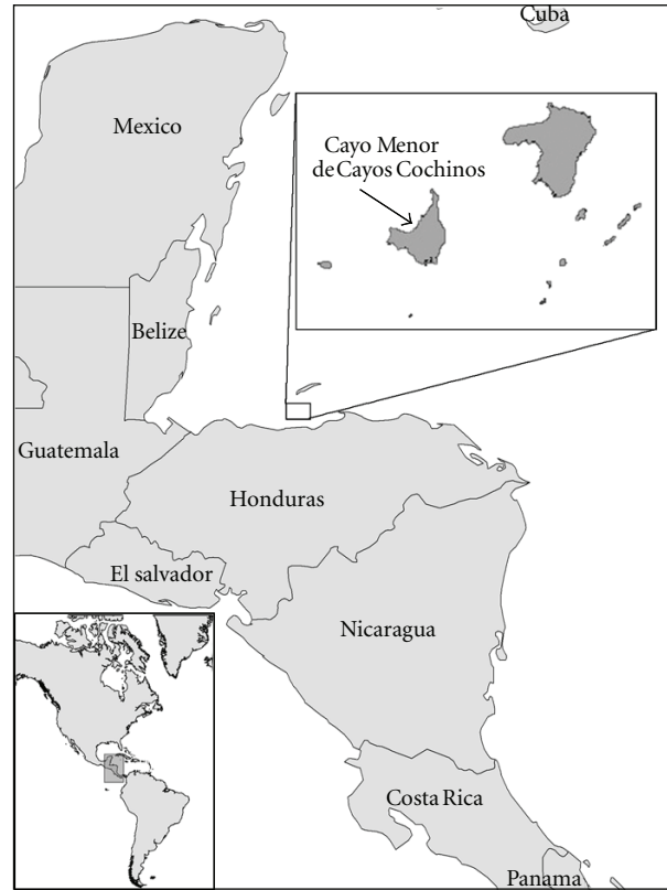
FIGURE 2: Map of the study site, the Honduran island, Isla Cayo Cochino Menor ( 15.97^{\circ}\text{N} , 86.47^{\circ}\text{W} ).

This paper reports on the effects of capture technique on the leukocyte profiles of the Black-chested Spiny-tailed iguana ( Ctenosaura melanosterna , Figure 1), which is a medium-sized lizard that has a narrow geographic range limited to the Rio Aguan Valley in north-central Honduras and the Cayos Cochinos (Hog Islands) archipelago 17 kilometers off the country’s northern coastline [17]. Specifically, we tested the hypothesis that compared to iguanas captured by a noose and sampled immediately, iguanas captured in baited traps would have higher numbers of circulating heterophils and lower numbers of circulating lymphocytes, resulting in a higher heterophil : lymphocyte ratio and reflecting elevated stress due to cage capture. This study was part of a larger project using a variety of capture techniques to measure C. melanosterna demography and health across a range of natural and human altered environments.